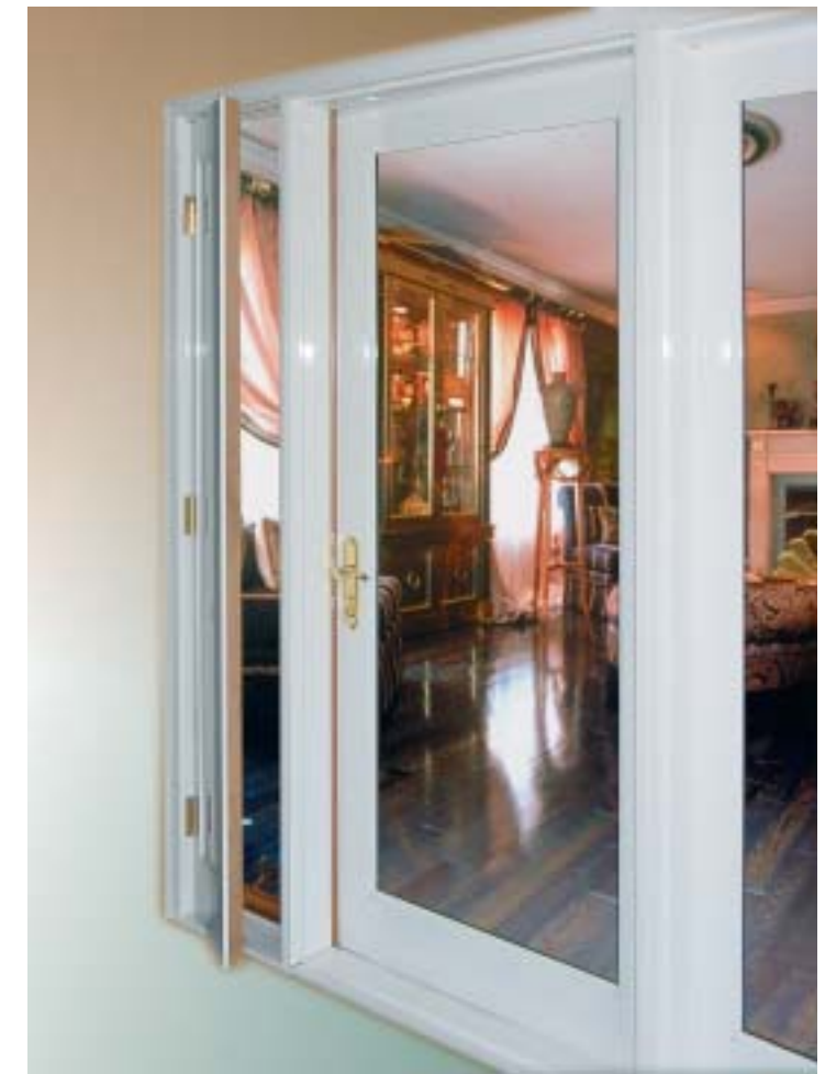
Series 2900 (inswing) • Series 2901 (outswing)